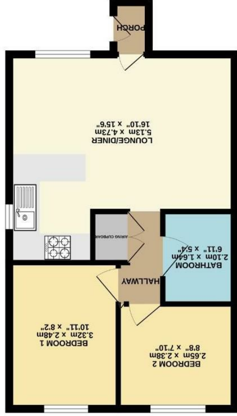
GROUND FLOOR 42.2 sq.m. (455 sq.ft.) approx.

What every attempt has been made to ensure the accuracy of the floorplan contained here, measurements of rooms or this statement. This plan is for guidance purposes only and should be used as such by any prospective purchaser. The services, systems and appliances shown have not been tested and no guarantee as to their quality or efficiency can be given. Made with Hoxpox ©2023